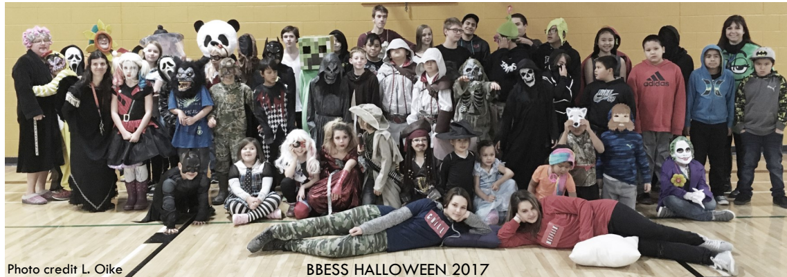
BBESS HALLOWEEN 2017

Garden Club Meetings: Every Wednesday at 7—8 pm. Join us for discussions on various topics. Come share your ideas, knowledge and experience with others. The coffee will be on!